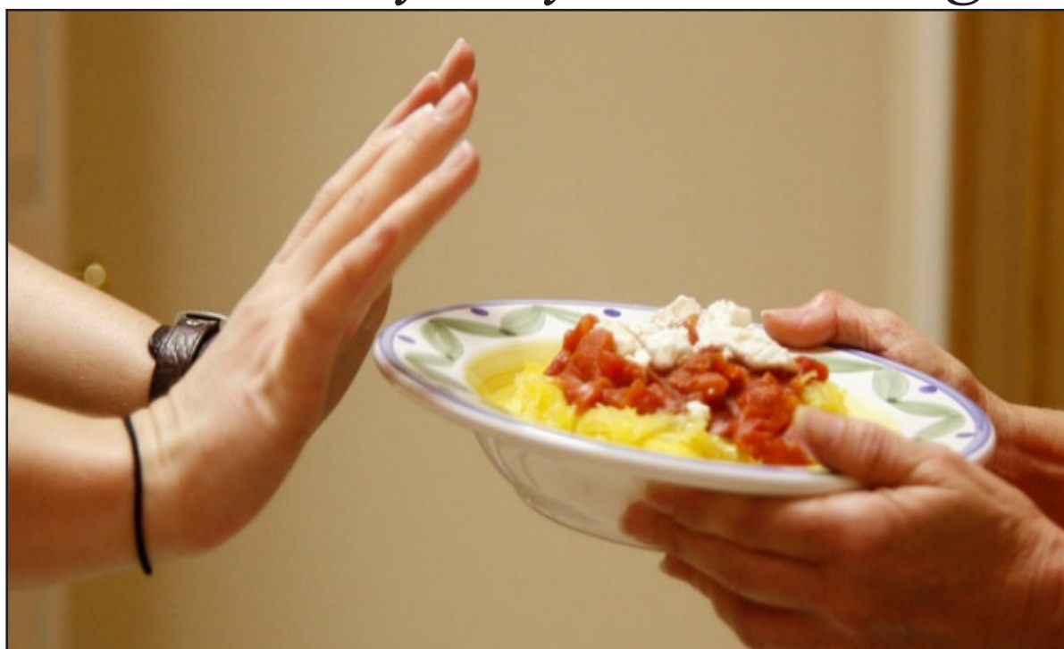
Skipping any meal to lose weight is unhealthy, and life threatening. There are many other solutions to losing weight besides skipping meals.