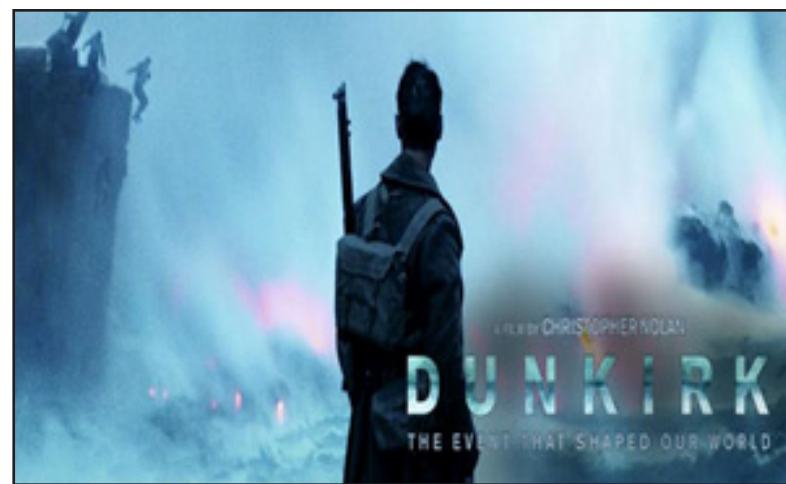
Movie poster for the upcoming film Dunkirk