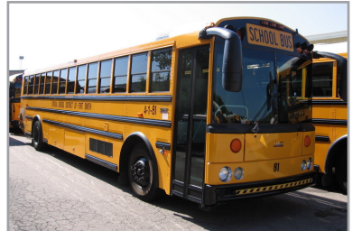
No Bus for Baseball, Page 6

2nd Place award-winner from the American Scholastic Press Association