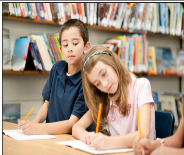
Is it really worth it to take that peek?