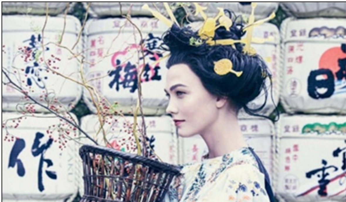
American model Karlie Kloss portrays stereotypical Japanese culture in the Vogue diversity issue