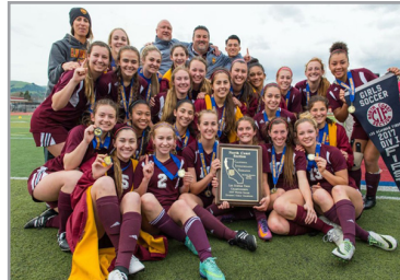
Benched by Injury, Page 5