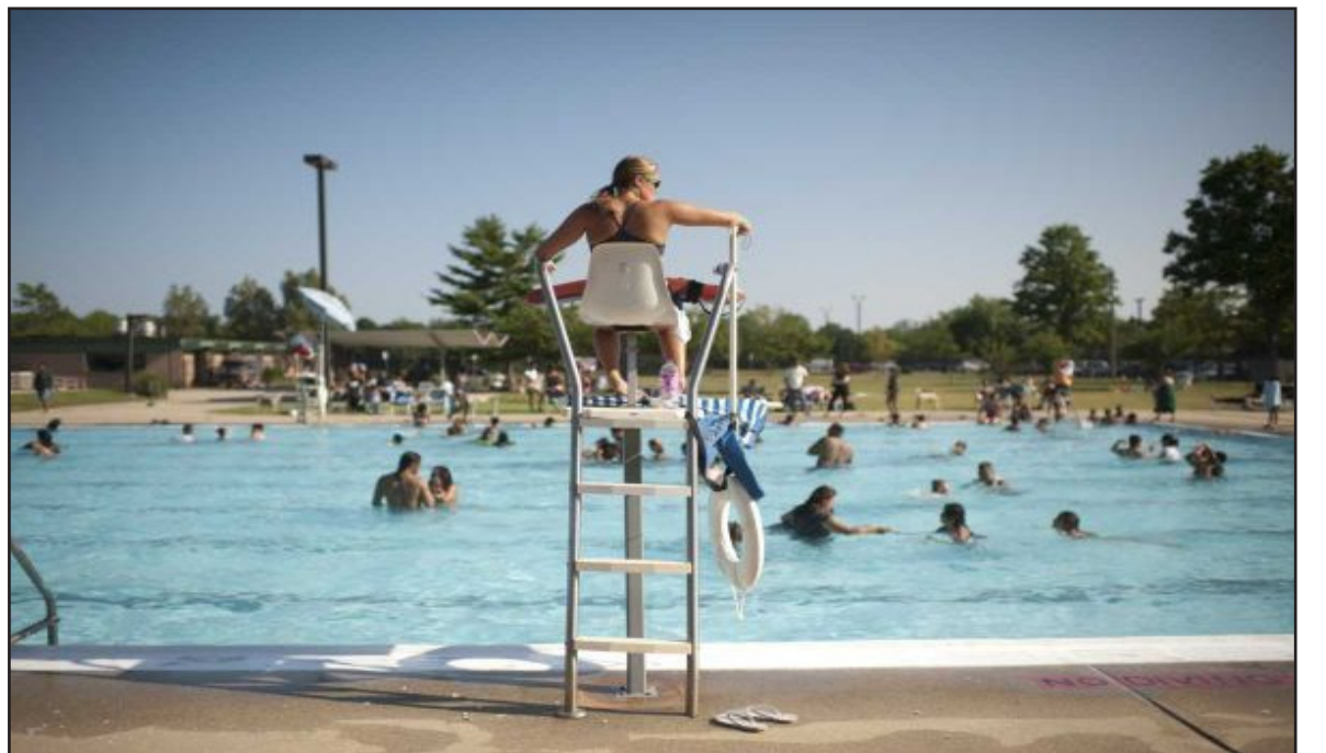
Being a lifeguard is a summer job that gives teenagers a great opportunity to work, tan and also save lives.

for the real-life situations. They are taught the right techniques and are shown how to save a life which is important when becoming a lifeguard. "The best part is helping people in need", meanwhile she said, "The worst part would be the long hours in the sun." Being a lifeguard brings the satisfaction of knowing you can save someone's life and teaches you valuable life skills. However it isn't the right job for everyone as there are long hours in the blazing summer heat.