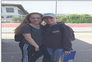
Life as a Twin, Page 4