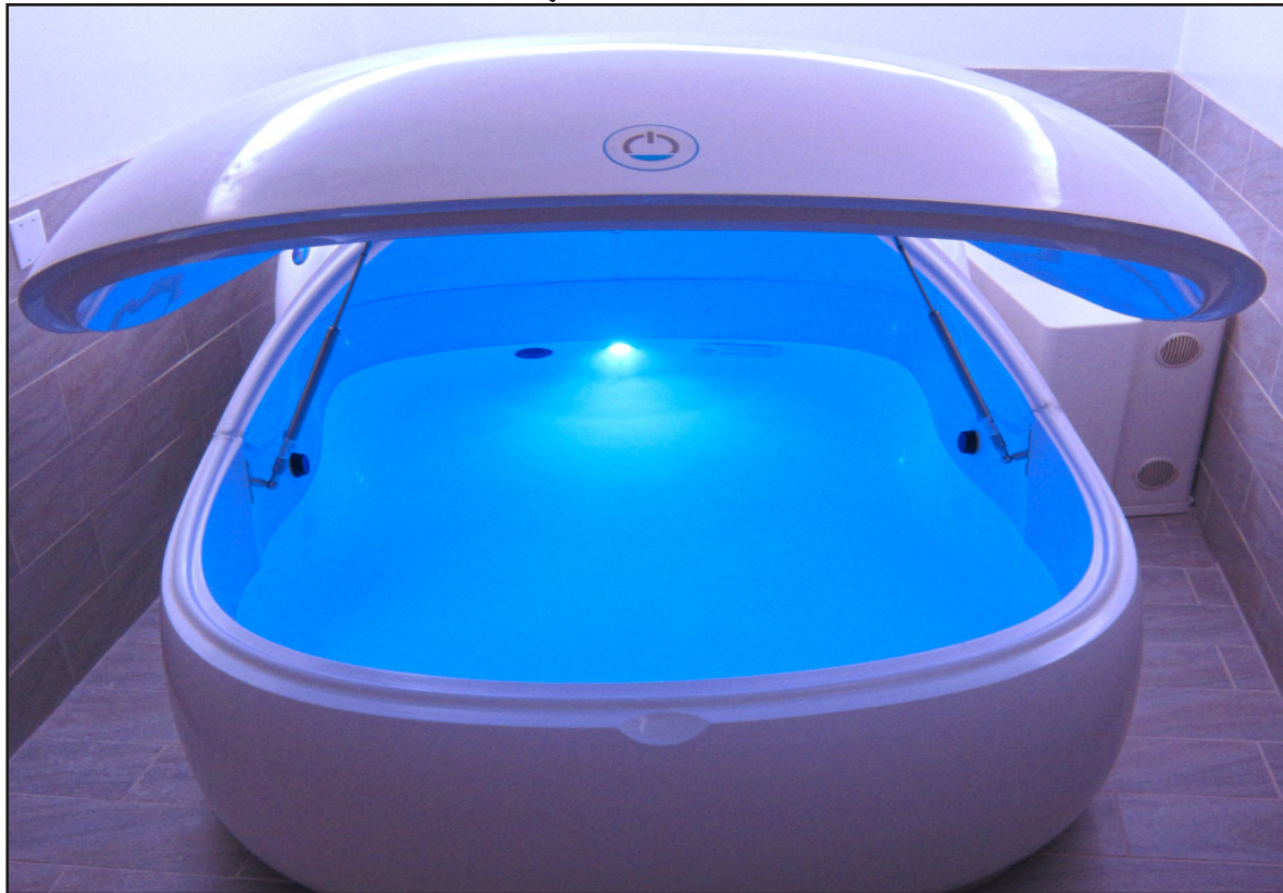
Sensory deprivation soars in popularity as athletes such as Steph Curry use it to recover after games.