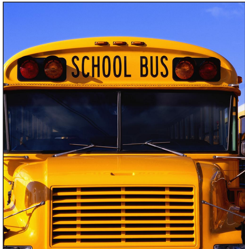
School buses often transport school teams to sporting events, but not Liberty's baseball team.