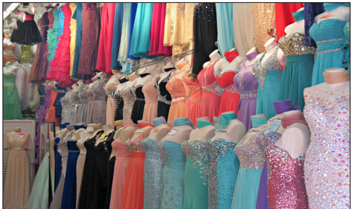
Of the sea of options available of prom dresses, the choice always comes down one.