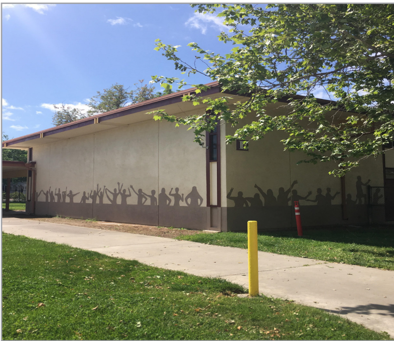
PADA's newest art project found in the L-Wing will hopefully not be the last piece of art they complete.

School academies: they've been designed to help students achieve more in school, graduate, and/or get accepted into colleges they want to enroll in. But, in the presence of a possible cut to school funding in Senate Bill 1070, some California schools face risk of losing their academies, even right here at Liberty High School, where funding for the PADA Academy is in question. SB 1070 was a provisional opportunity that gave schools in California a base fund of $20,000,000 from the Community College Reversion Account for Career and Technical Education. Using this bill, new technical career pathways like academies were designed to decrease dropout rates, prepare students for life in the real world, and to get to college by building off of original