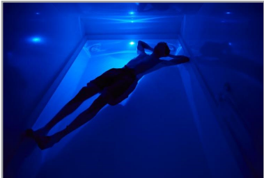
Float Spa, Page 3