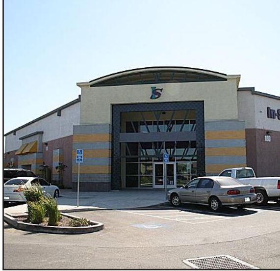
The local gyms are often used by Liberty students. in order to train, get fit and even have fun.