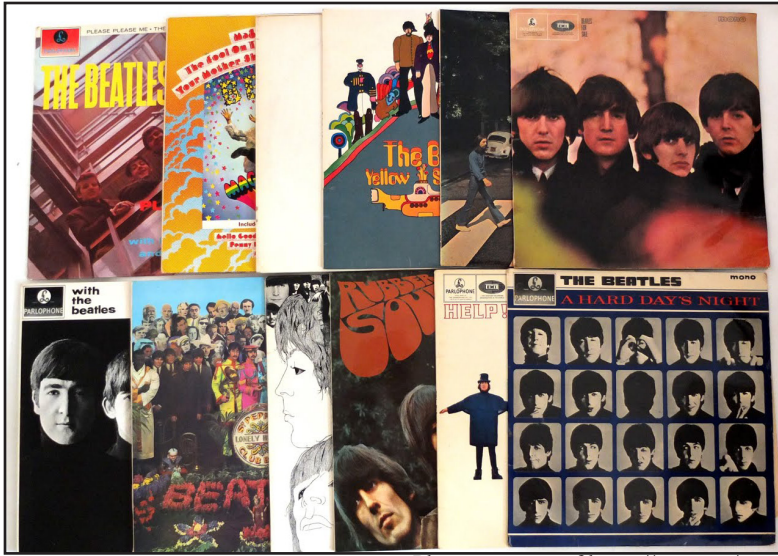
The Beatles revolutionize the idea of album covers by introducing psychedelic art into their album covers.